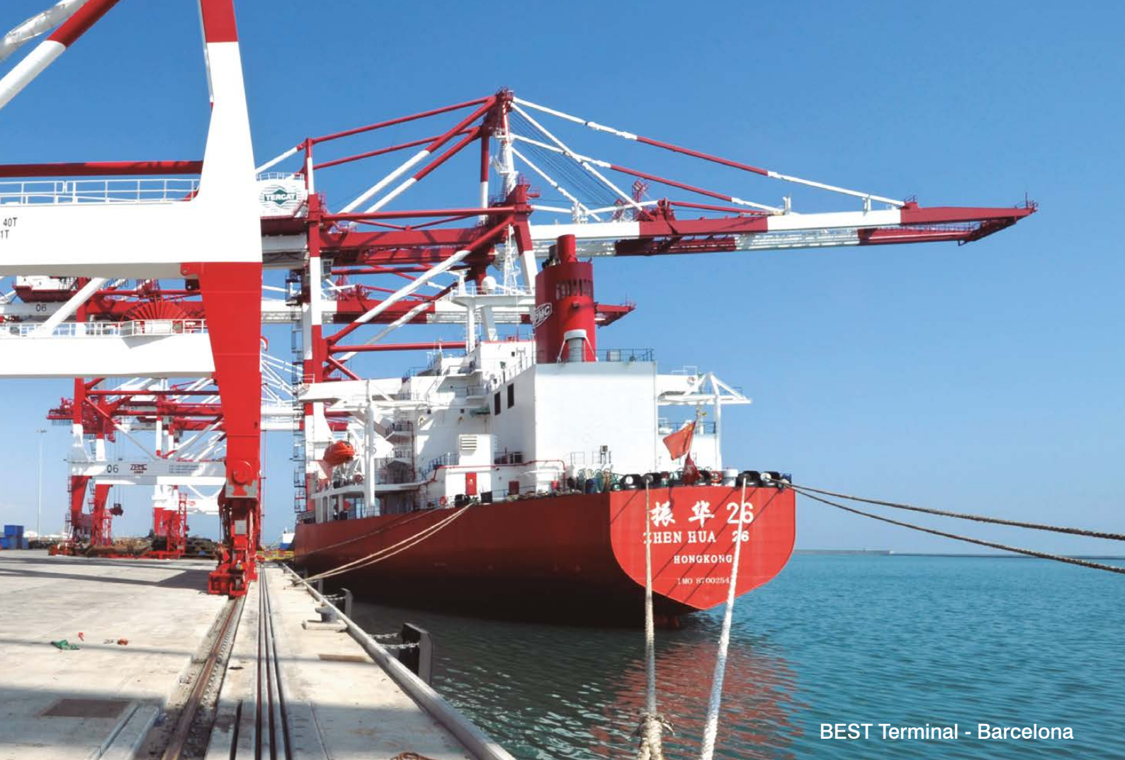
BEST Terminal - Barcelona